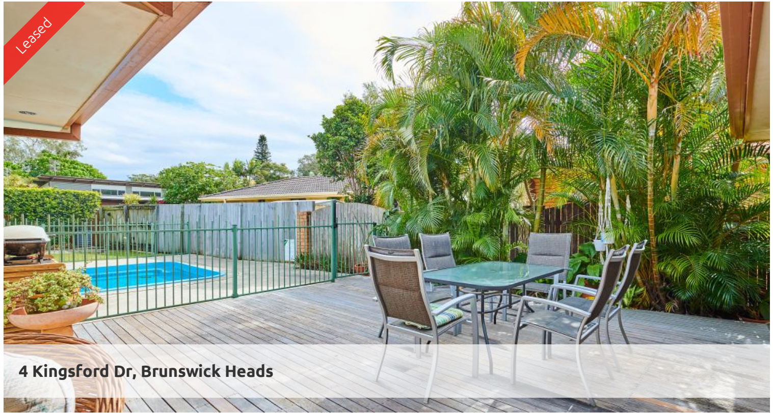
4 Kingsford Dr, Brunswick Heads