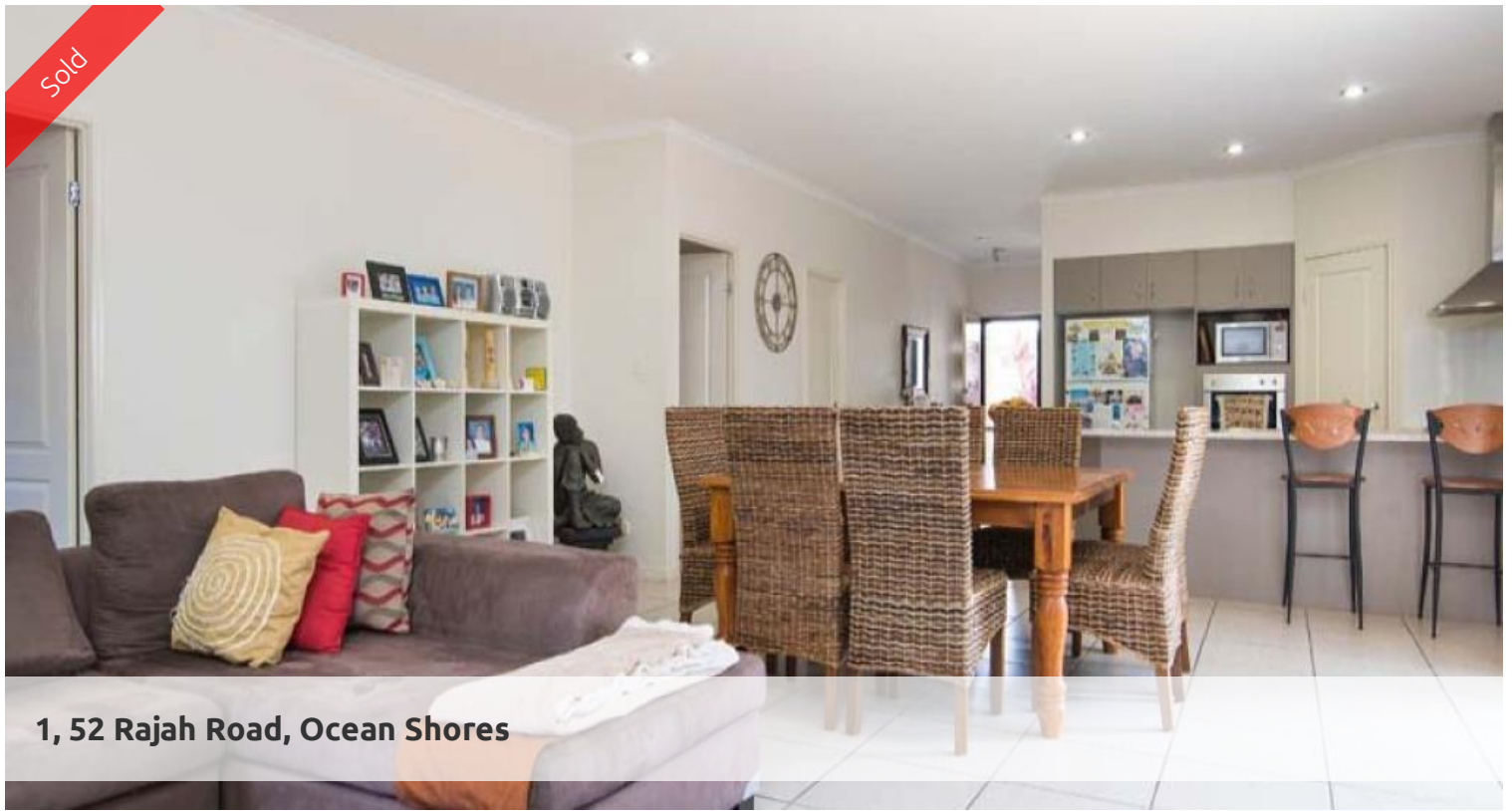
1, 52 Rajah Road, Ocean Shores