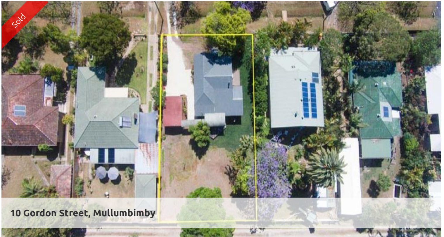
10 Gordon Street, Mullumbimby