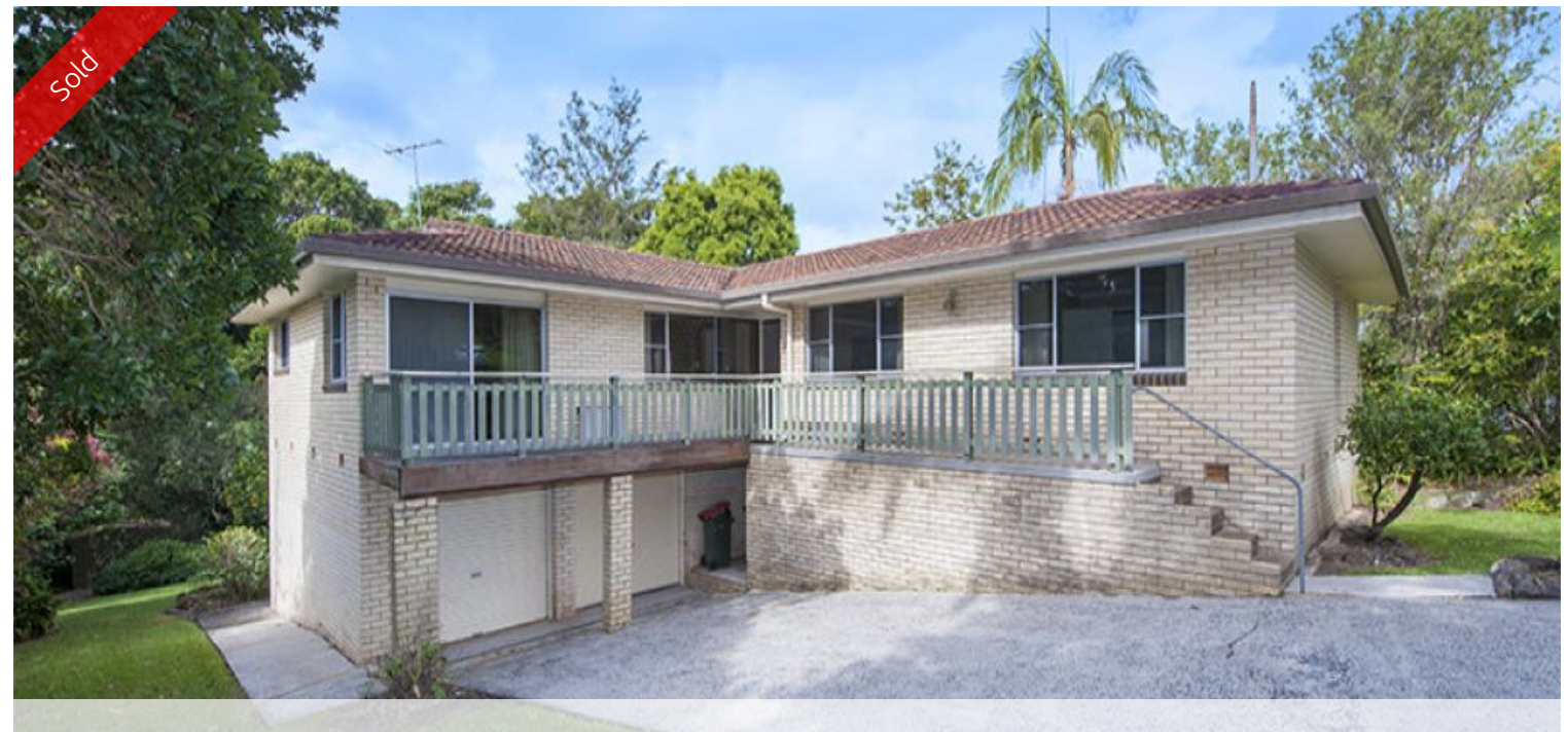
162 Orana Road, Ocean Shores