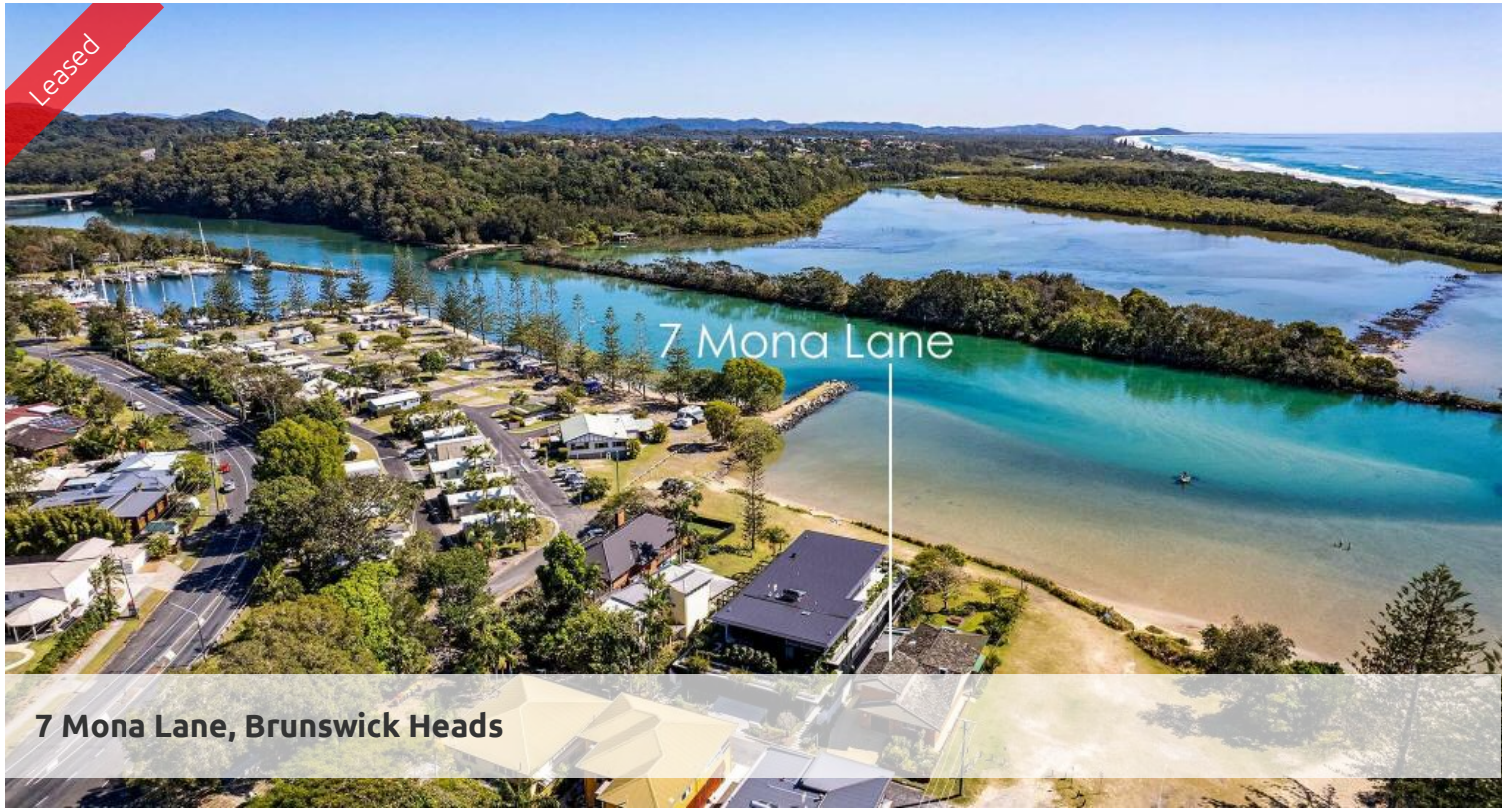
7 Mona Lane, Brunswick Heads