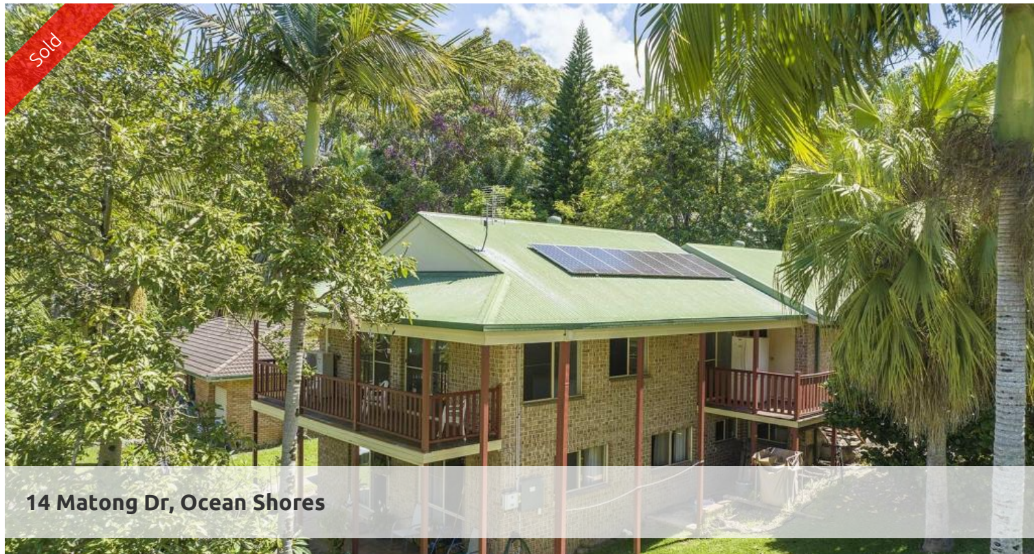
14 Matong Dr, Ocean Shores