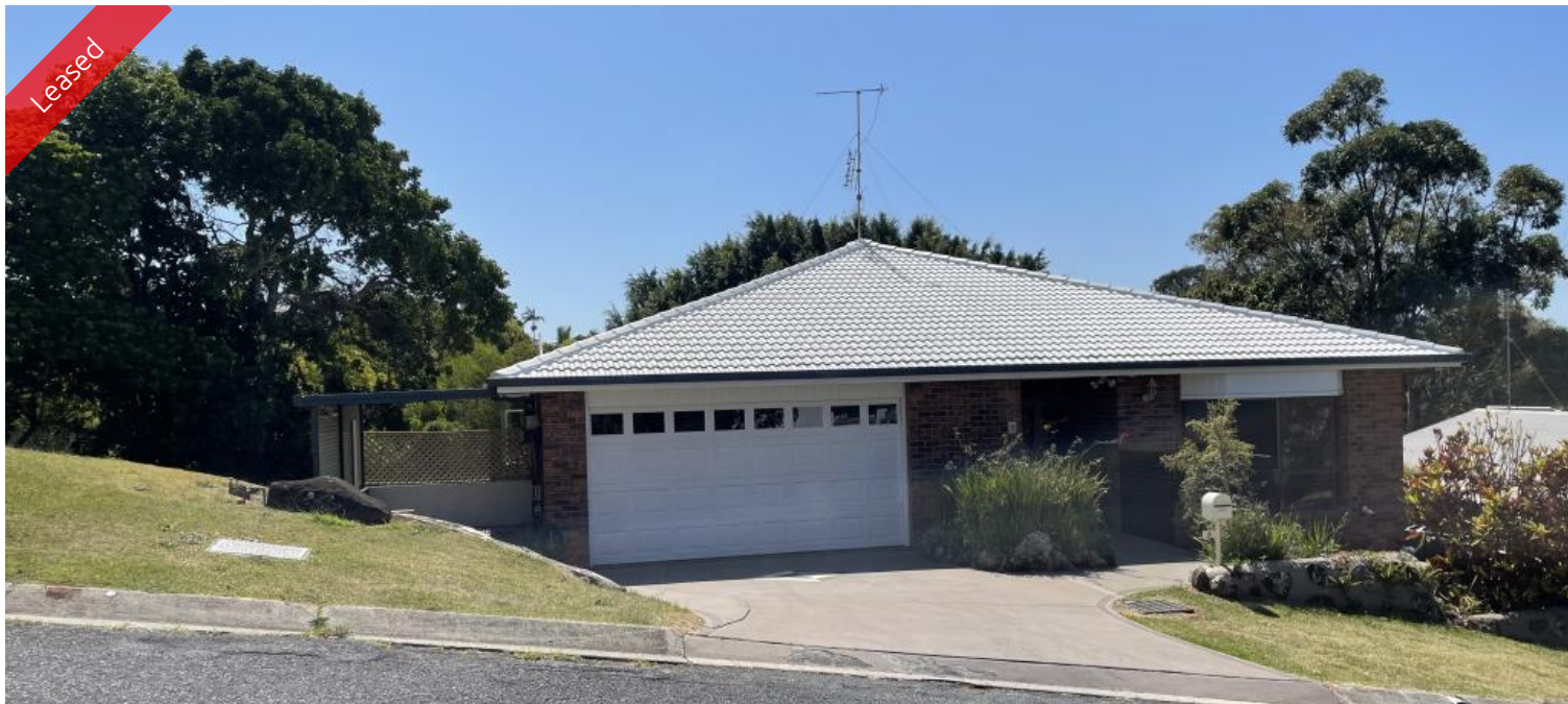
9 Wirruna Avenue, Ocean Shores