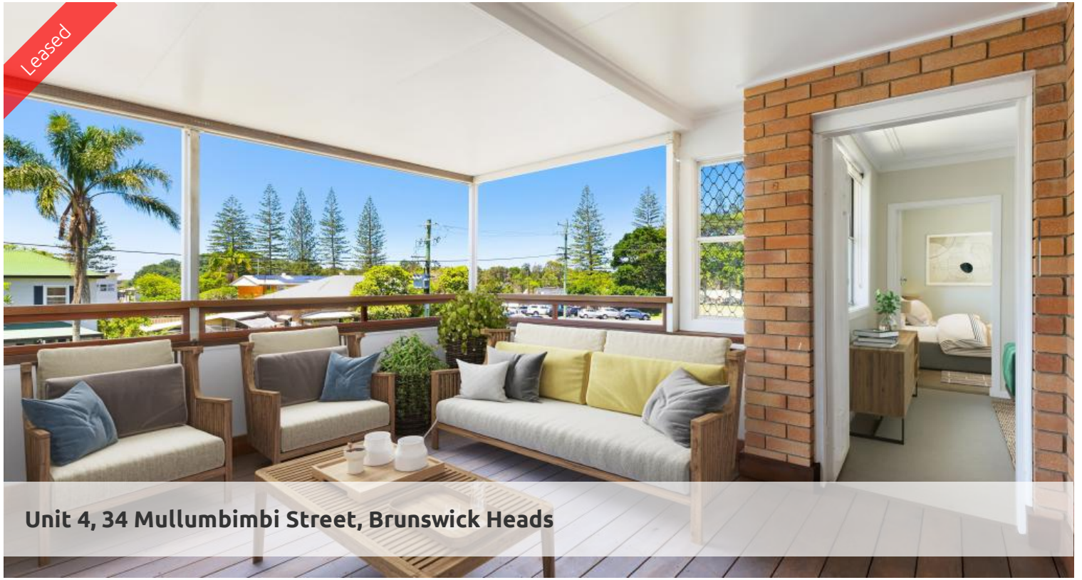
Unit 4, 34 Mullumbimbi Street, Brunswick Heads