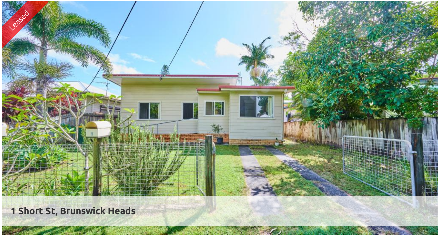
1 Short St, Brunswick Heads