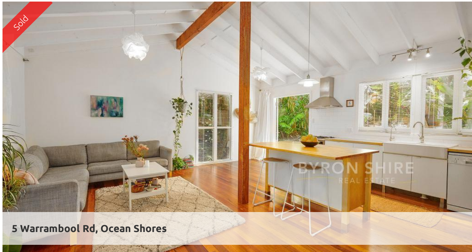
5 Warrambool Rd, Ocean Shores